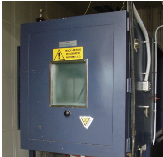
Fig. 1: Climatic chamber