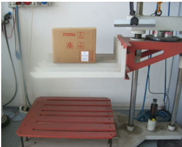
Fig. 1: Drop Test Machine during packaging testing