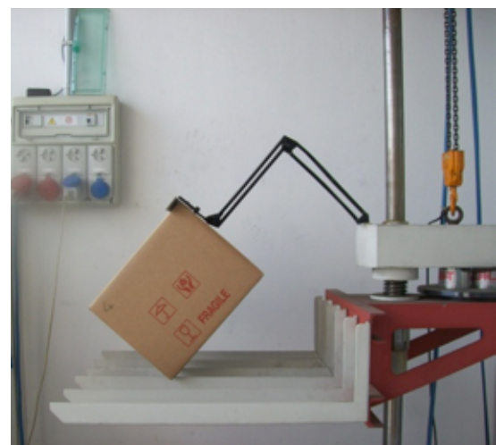
Fig. 3: Drop Test Machine during packaging testing (Note:special fork)