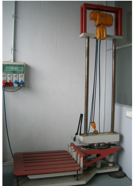
Fig. 2: Drop Test Machine

* We can arrange drop testing even in case of object of larger size or volume by means of a release hook.